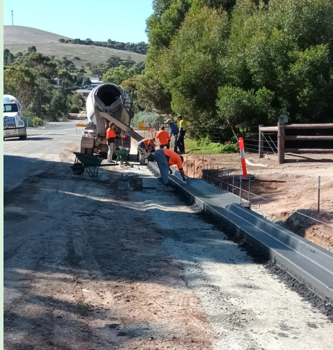
Council has been attending to works throughout the region including Allen Street in Burra (above left) and new asphalt works at the Eudunda Sports Complex.